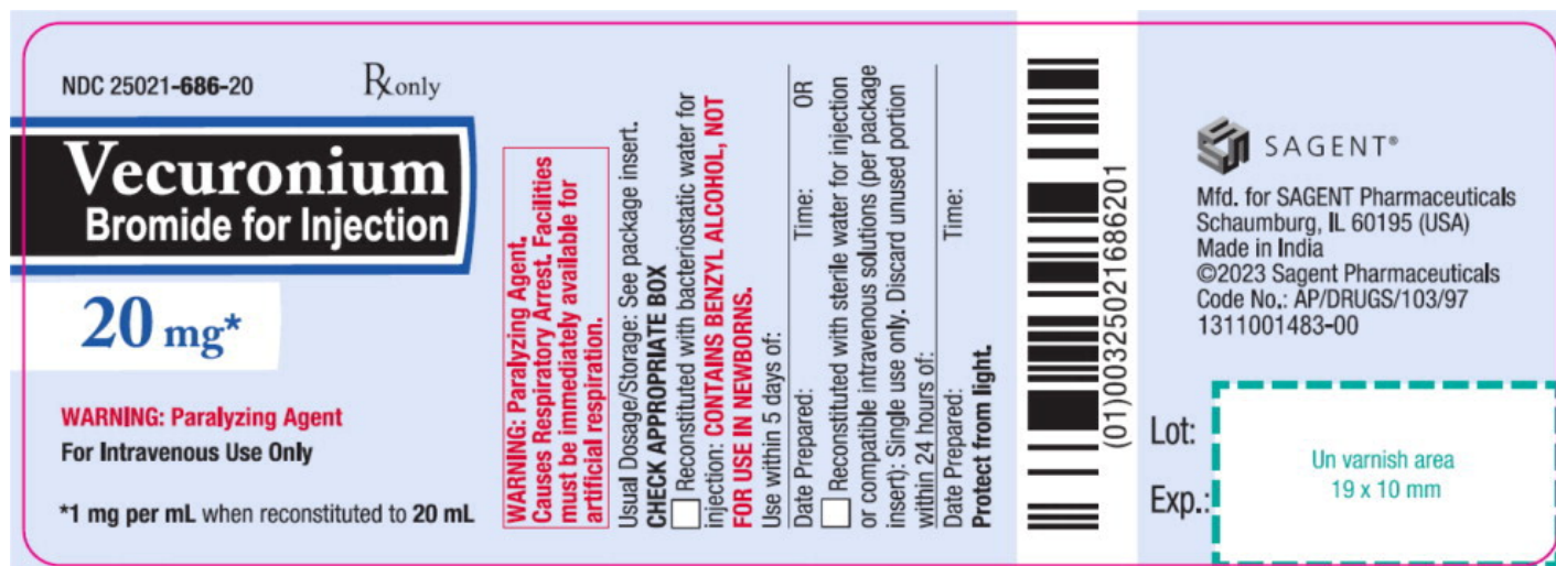
PACKAGE LABEL - PRINCIPAL DISPLAY PANEL - Sticker Label