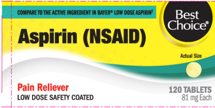
Best Choice Aspirin Tablets

PROXIMATELY REGISTERED BY VALLI MANUFACTURING, CO. 3000 SHELBY AVE ANN ARBOR, MI 48106