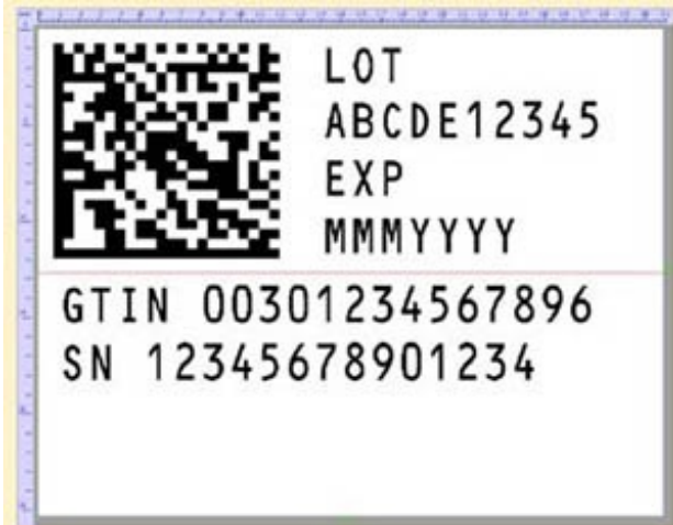
Representative Carton Serialization Image