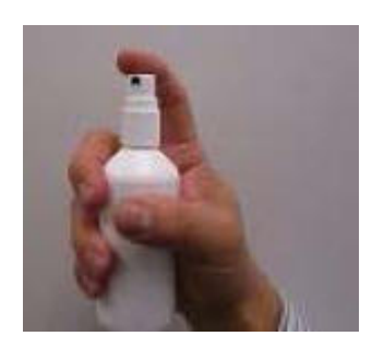
Step 3: Spray only enough Topicort<sup>®</sup> Topical Spray to cover the affected area, for example, the elbow (See Figure C) . Rub in Topicort<sup>®</sup> Topical Spray gently.