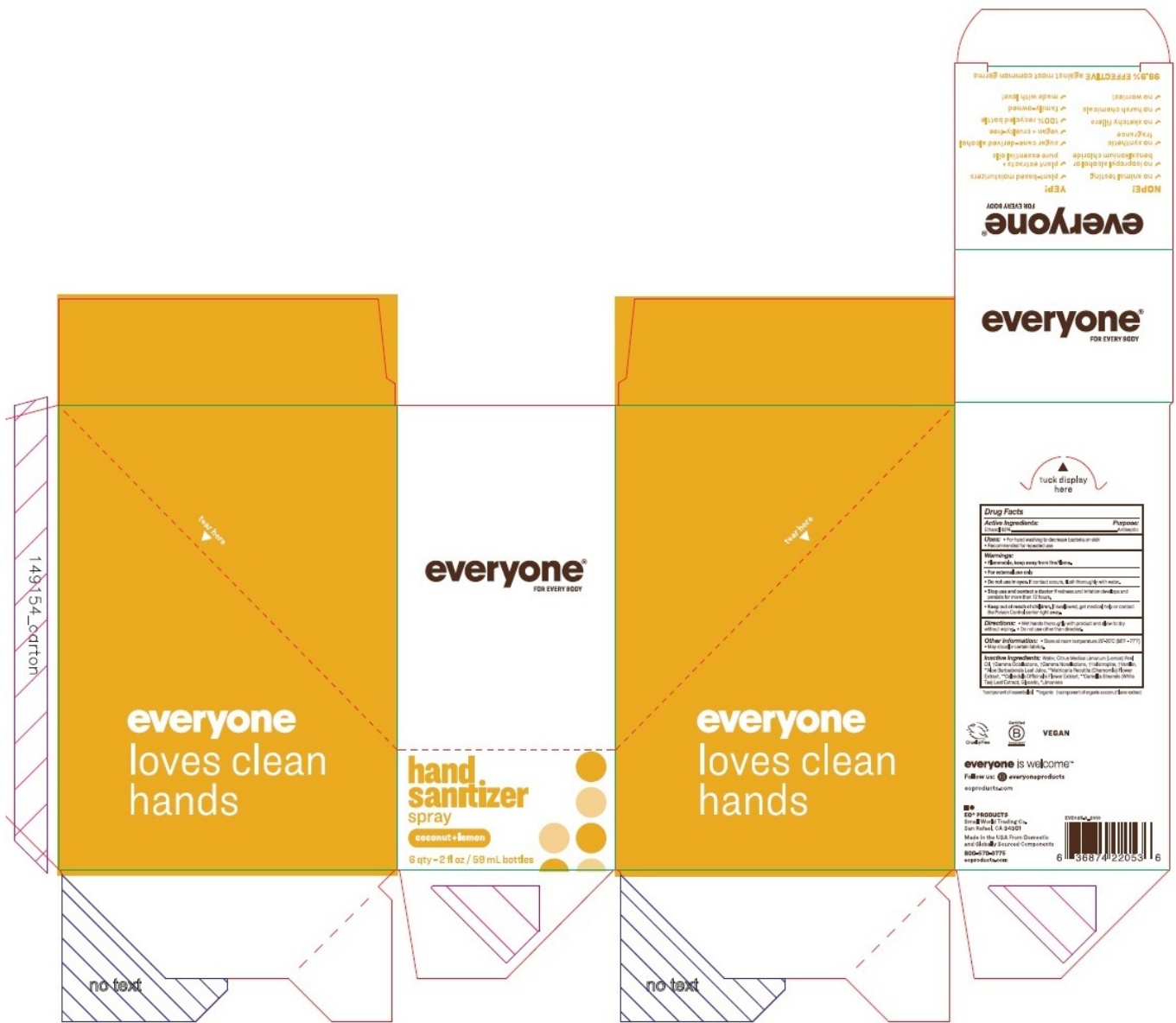
PACKAGE 237 mL