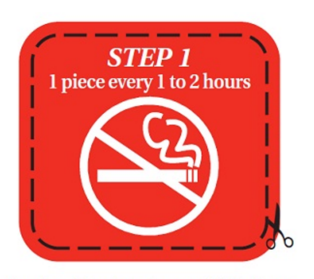
At the Beginning of Week #1 (Quit Date)