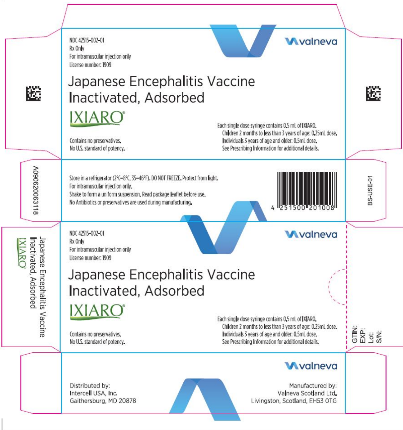
PACKAGE LABEL.PRINCIPAL DISPLAY PANEL-SYRINGE LABEL