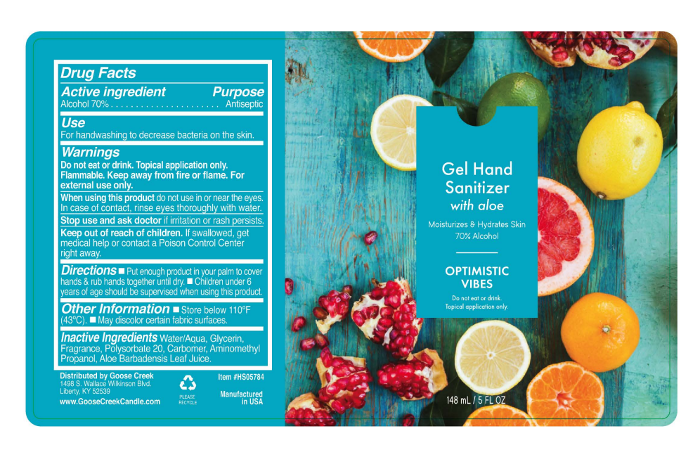
Artwork is Scale @ 100.0%