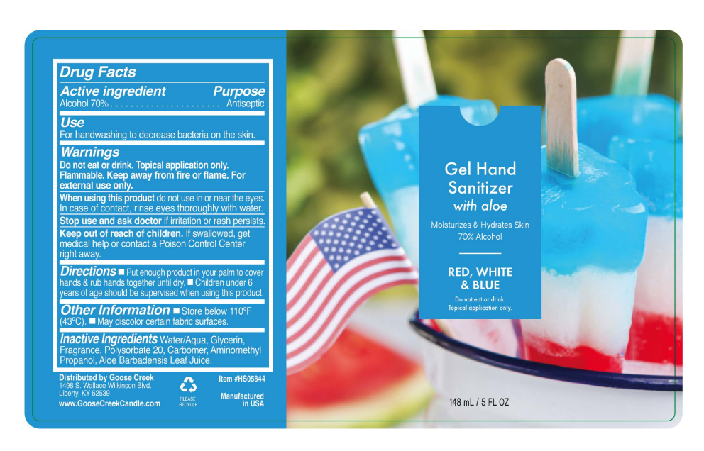
Artwork is Scale @ 100.0%