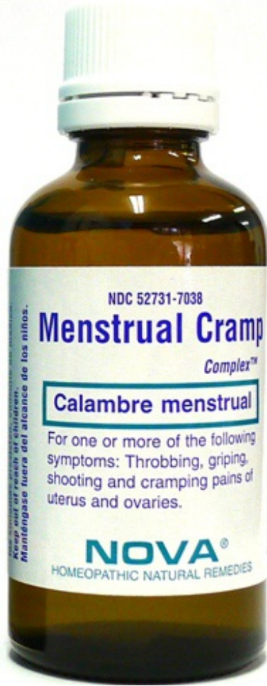
Menstrual Cramp Complex Bottle Label