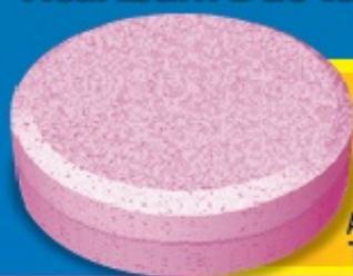
Actual Tablet Size