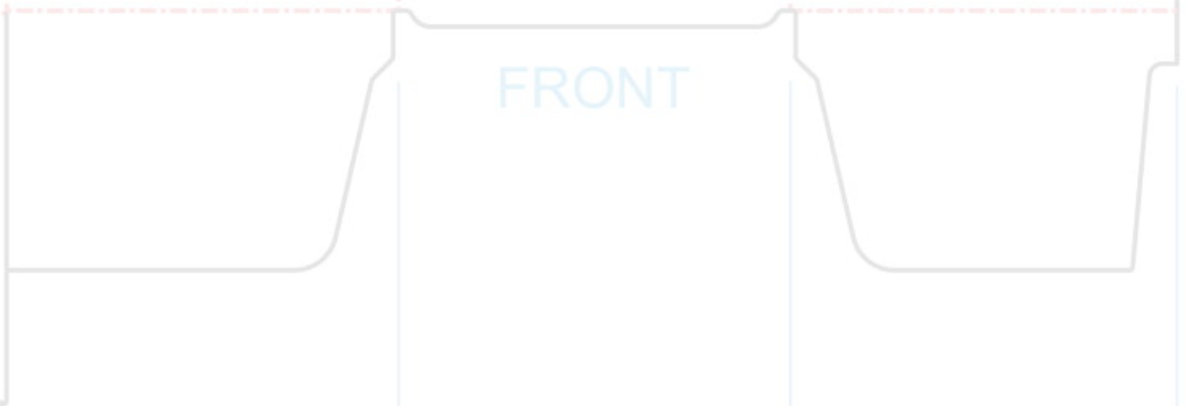
Principal Display Panel - 240 ml Bottle Label