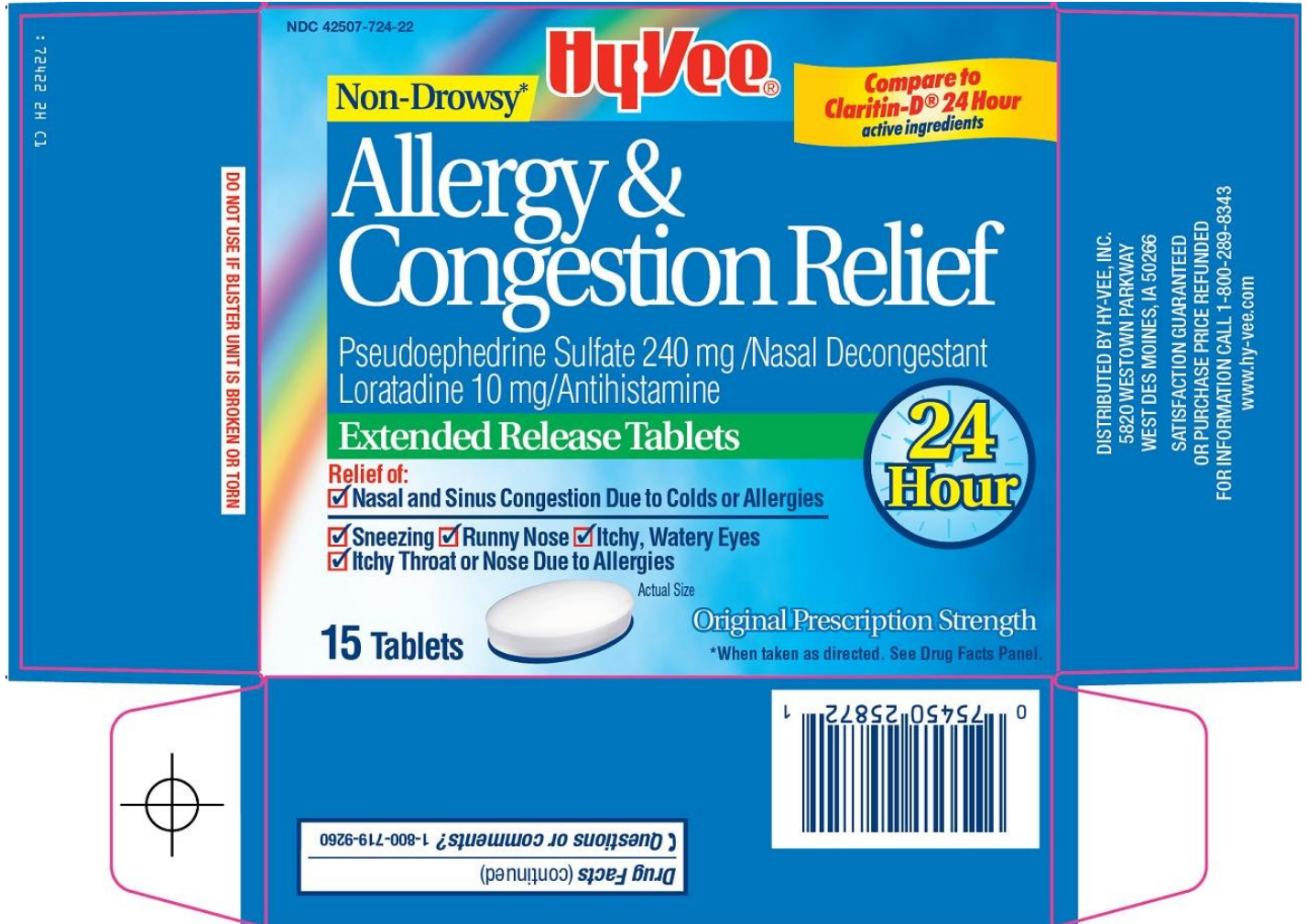
Allergy & Congestion Relief Carton Image 1

*When taken as directed. See Drug Facts Panel.