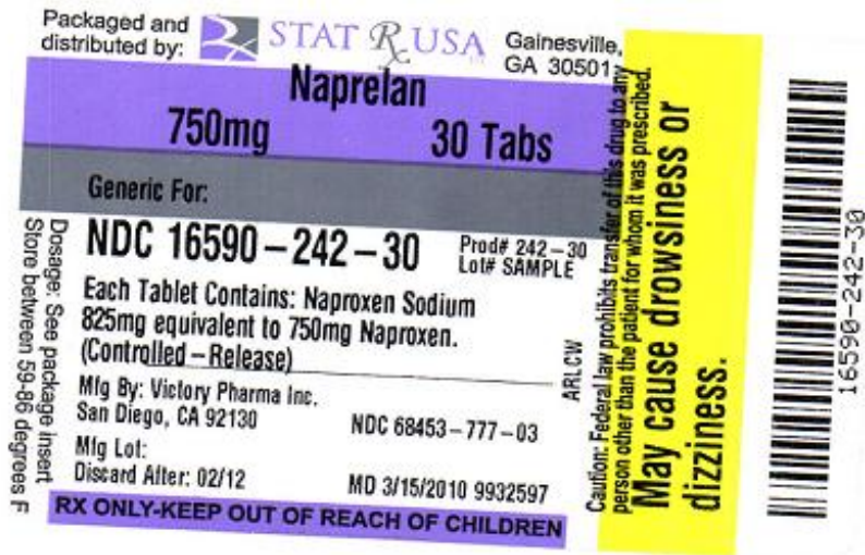
NAPRELAN 750MG LABEL