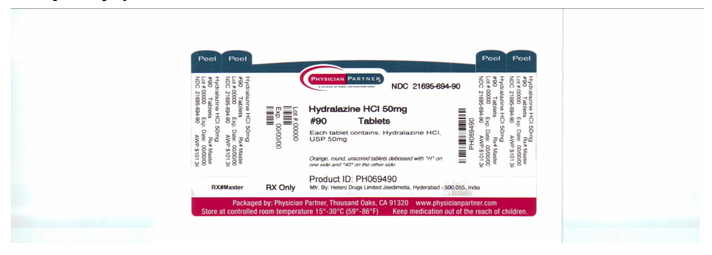
Principal Display Panel