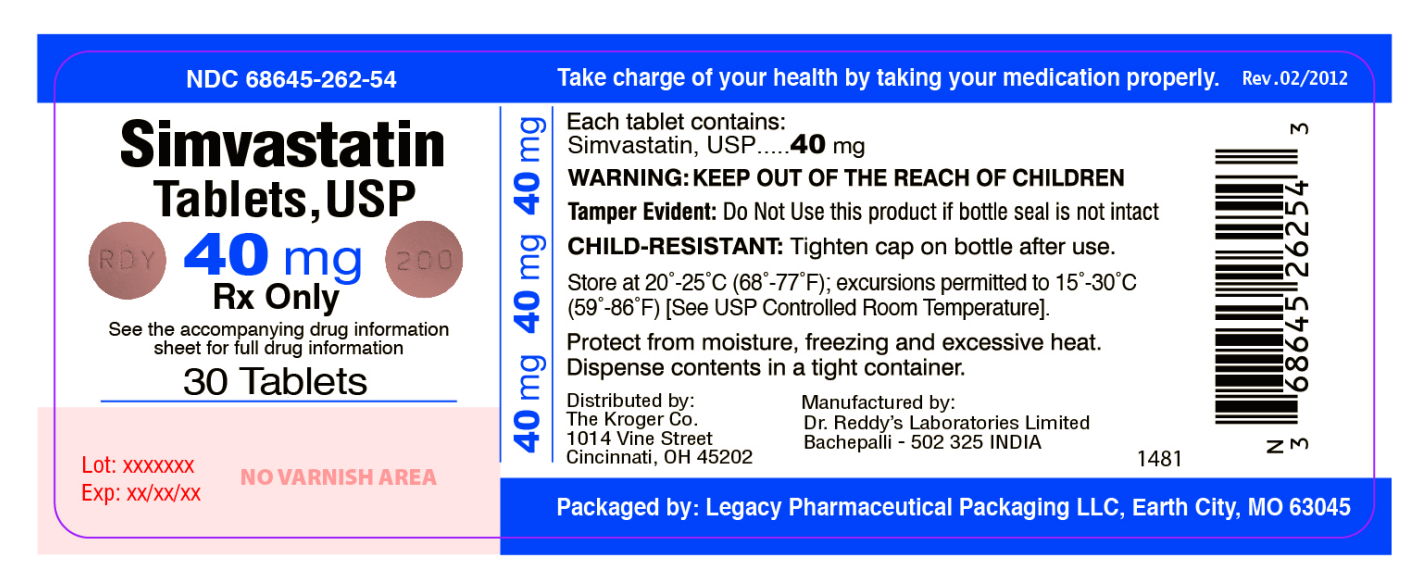
40 mg Simvastatin Bottle Label

NDC 68645-262-54 Simvastatin Tablets, USP 40mg Rx Only 30 Tablets