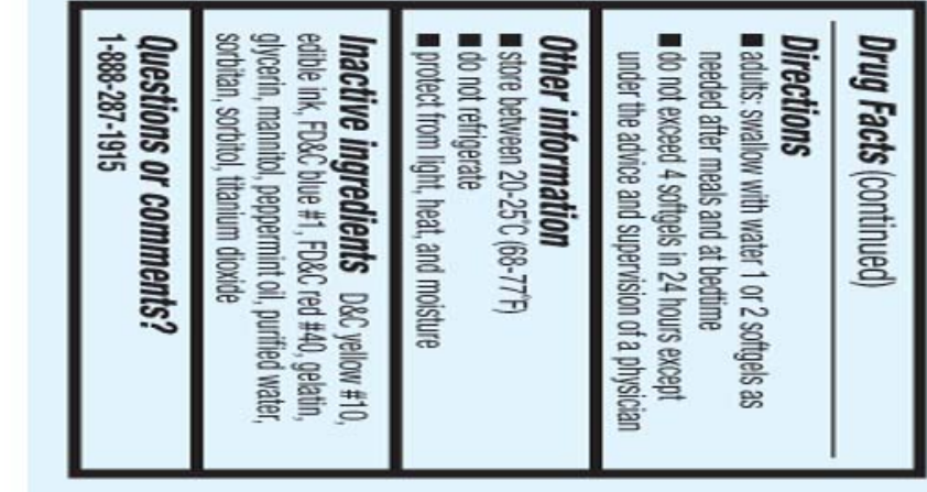
EQUATE Extra Strength Gas Relief