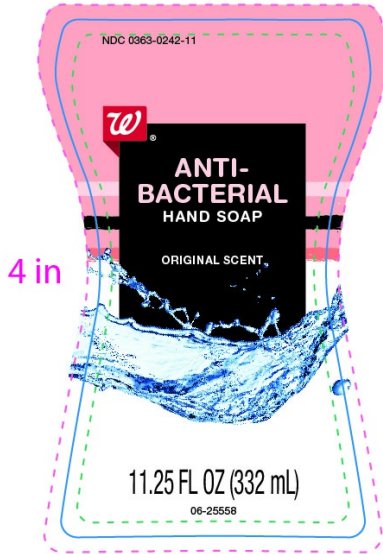
FRONT WHITE SUBSTRATE