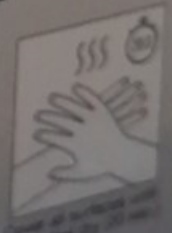
Cover all surfaces of hands for 20 sec.