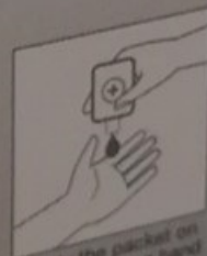
Empty the packet on the palm of one hand