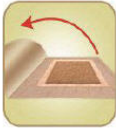
(2) Remove protective film