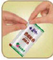
(3) Open the plastic tube