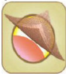
(5) Apply the plaster on the affected area