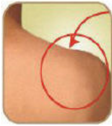
(1) Clean and dry affected area