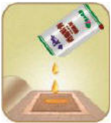
(4) Squeeze the contents enclosed in the plastic tube evenly onto the center of the pad