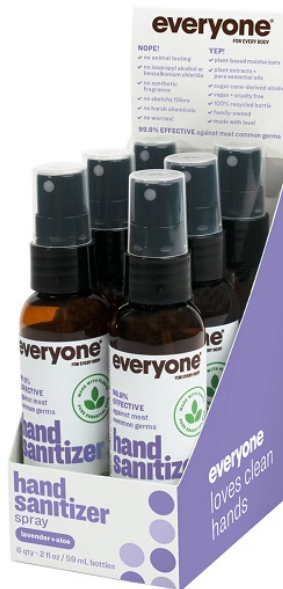
INNER PACKAGE LABEL

EO® PRODUCTS Small World Trading Co. San Rafael, CA 94901 Made in the USA From Domestic and Globally Sourced Components 800-570-3775 eoproducts.com