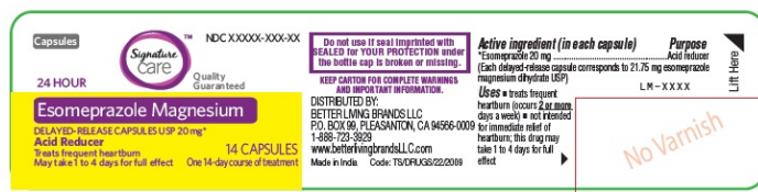
Top Ply (Page #1)