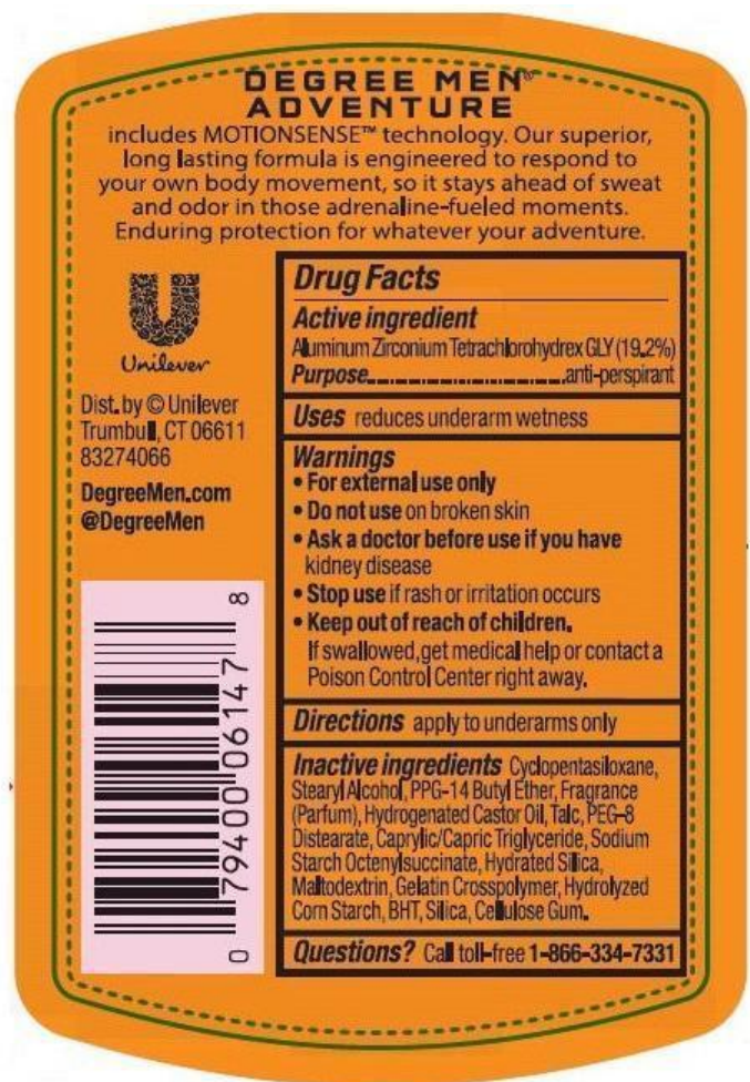
2.7 oz Twin Sleeve