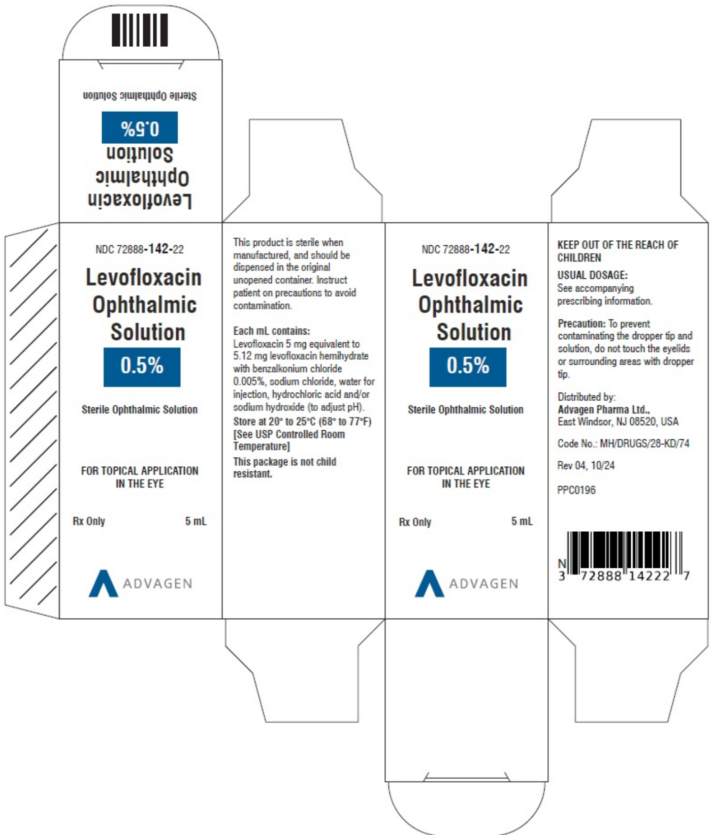
Levofloxacin Ophthalmic Solution, 0.5% Sterile Ophthalmic Solution - NDC 72888-142-22 - 5 mL Container Label