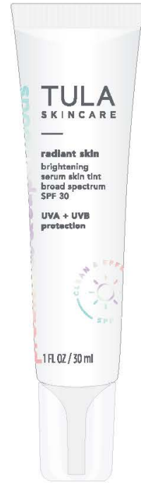
VISUAL ONLY take artwork from mech