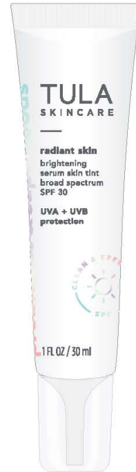
VISUAL ONLY take artwork from mech