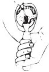
Figure 2. Laryngoscopist's view showing cannula in place in adult larynx and trachea, with black guide mark just proximal to cords.

8. Hold injector in manner of holding a pen, and insert tip of cannula between vocal cords and into trachea to the proper depth for instillation of local anesthetic. The black guide mark is positioned just proximal to vocal cords. At this depth, interior of larynx will be bathed with anesthetic solution from upper jet orifices and entire tracheal wall by lower jet openings. (NOTE: Black mark on cannula shaft indicates approximate depth for insertion in most normal patients without touching carina with distal tip.) Caution and gentleness during insertion should be observed and the cannula advanced a proportionately shorter distance in those persons suspected of having a high tracheal bifurcation or tracheobronchial anomaly. USE CAUTION WITH LARYNGOSCOPE TO AVOID POSSIBLE CANNULA BREAKAGE.