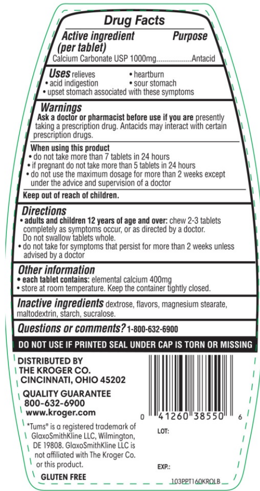
Package Label 72 Chewable Tablets