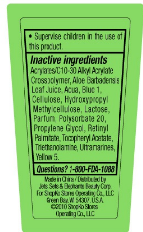
Sweet melon Bottle Label