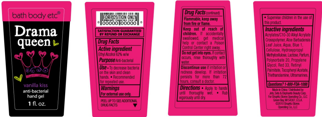
Drama queen vanilla kiss Bottle Label