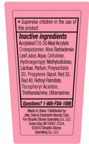
Candy apple Bottle Label