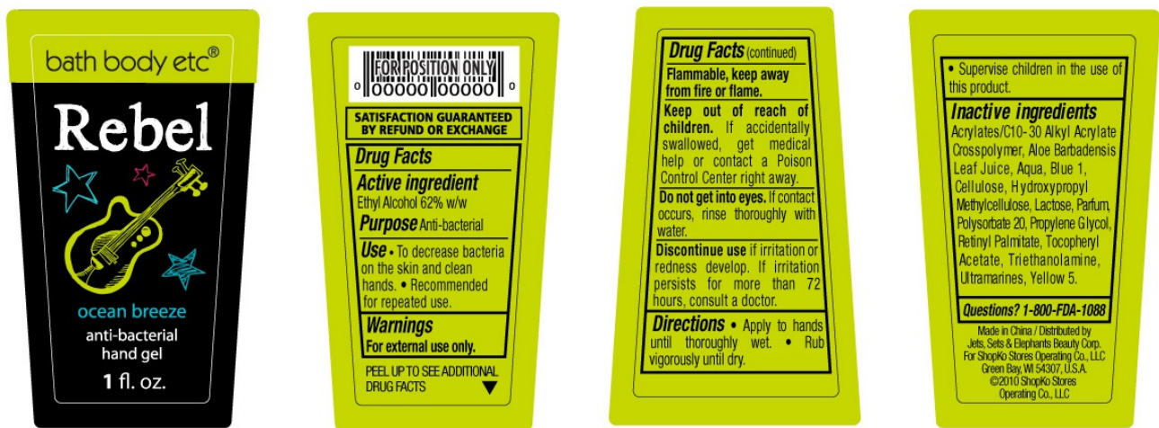
Rebel ocean breeze Bottle Label