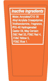
TRI-FOLD LABEL REMOVABLE LABEL