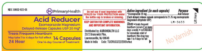
Top Ply (Page #1)