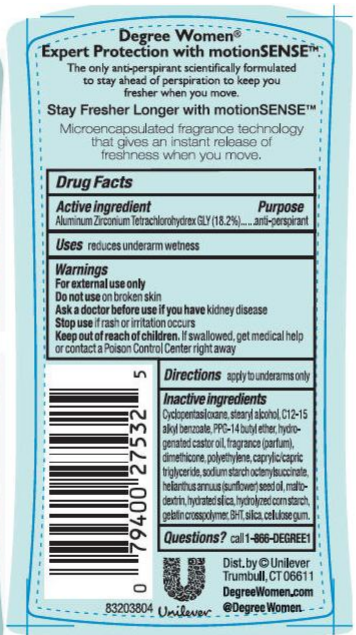
DFW 48 hour label