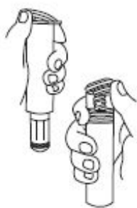
1. Remove protective caps.