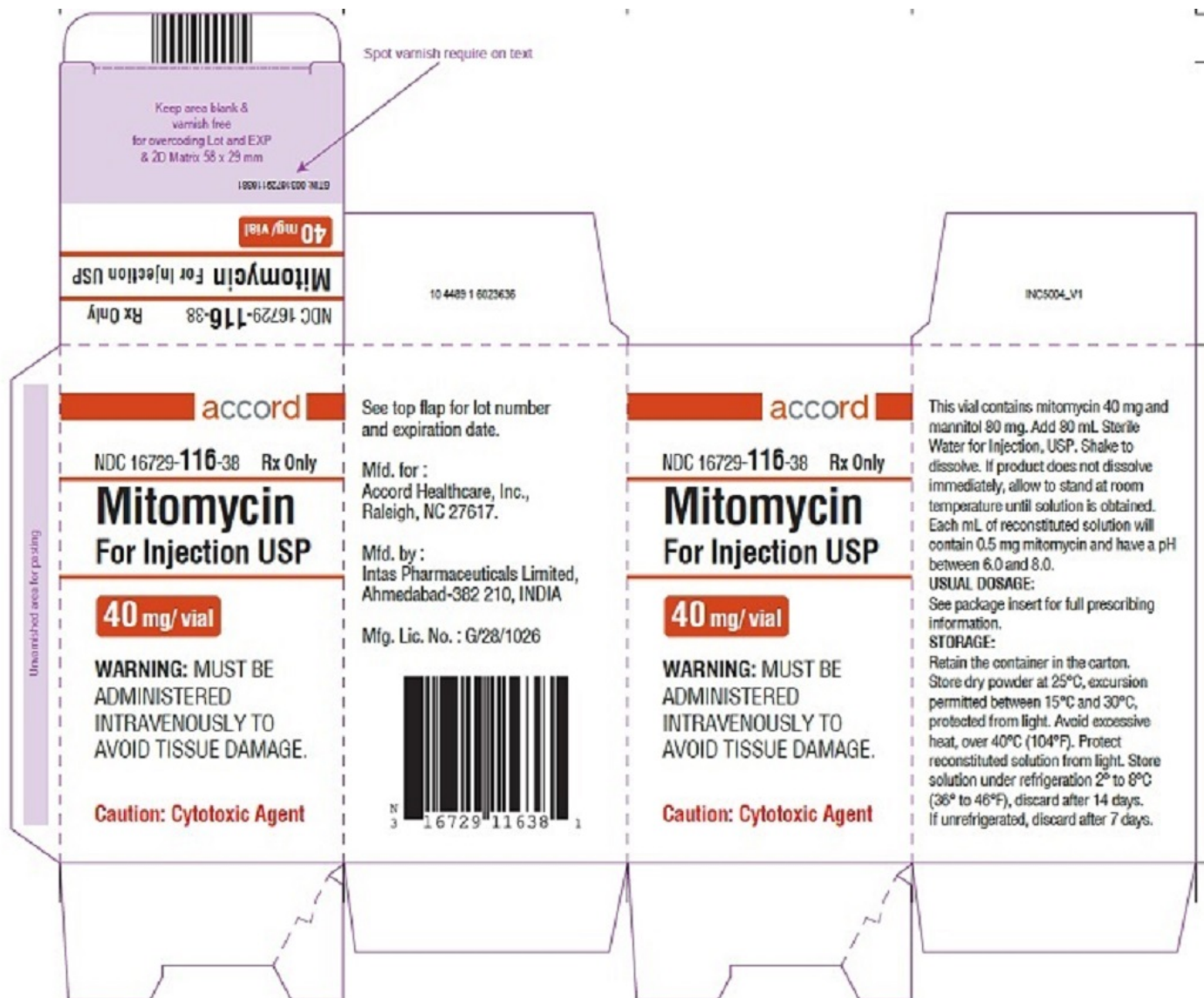
Carton Label-Mitomycin for injection USP 20 mg/vial