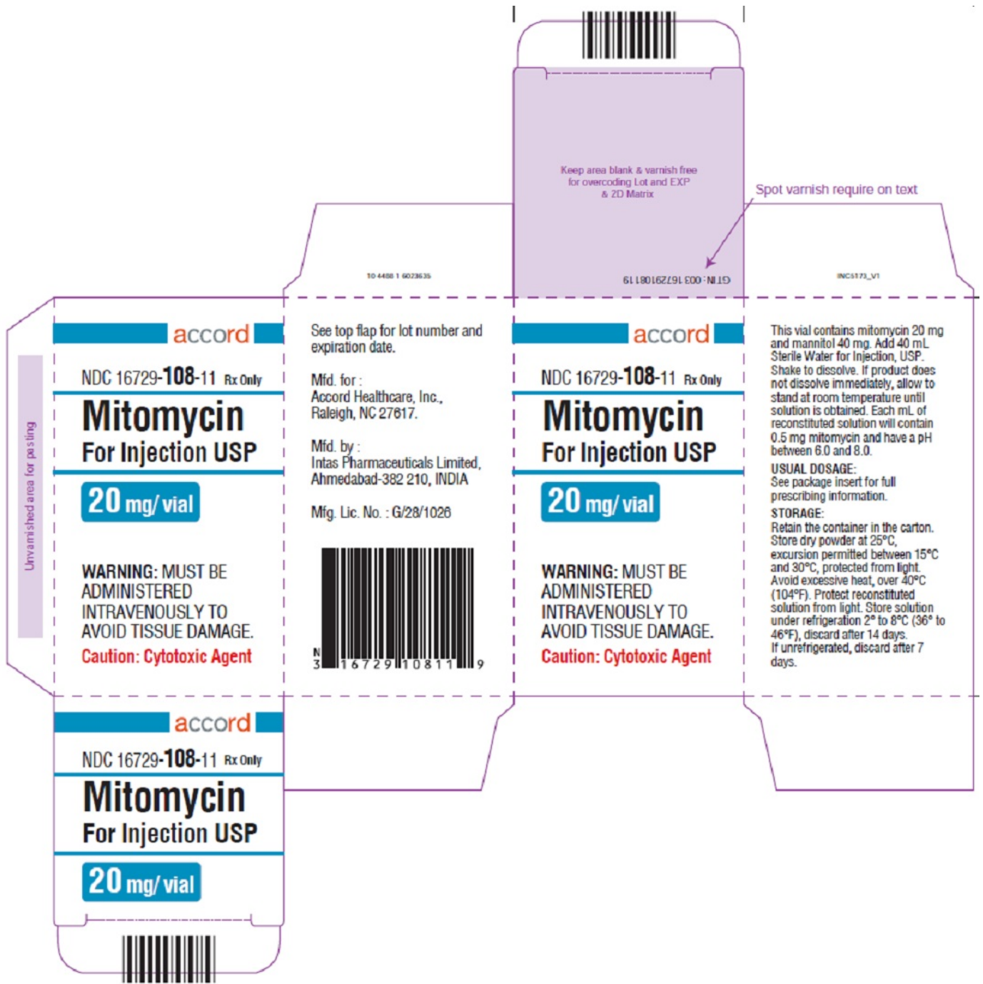
Carton Label-Mitomycin for injection USP 5 mg/vial