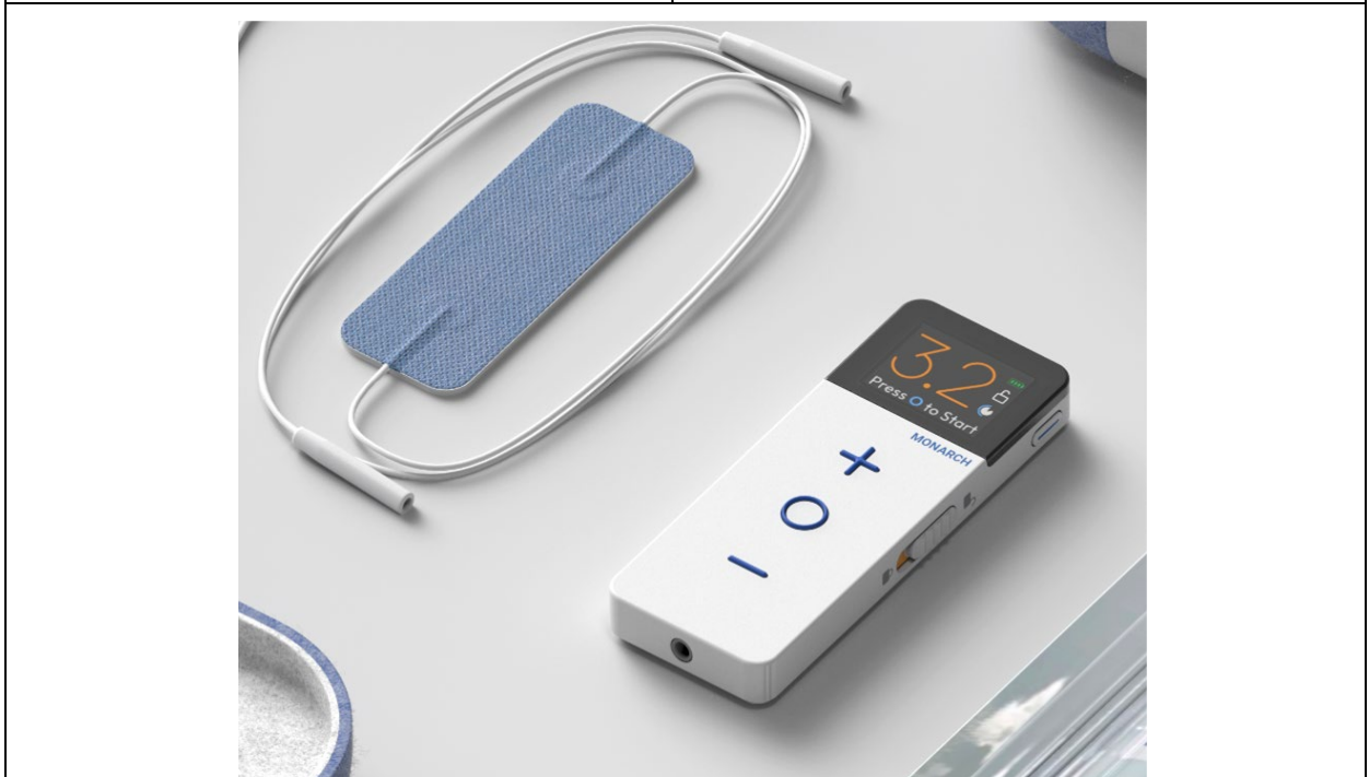
C) The Monarch NS-2 external (cutaneous) electrical patch beside the Gen 2.0 Monarch eTNS System.