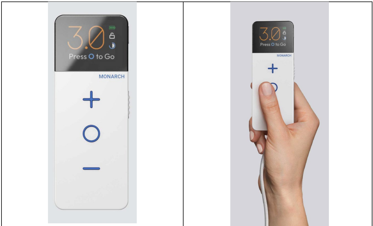
A) The Monarch Gen 2.0 external pulse generator