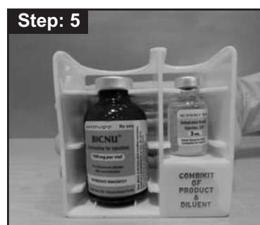
Step: 5 Hold the COMBI KIT guard by hand firmly and gently shake to dissolve the content.