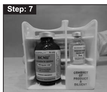
Step: 7 Hold the COMBI KIT guard by hand firmly and shake gently.