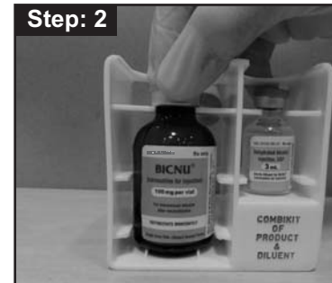
Step: 2 Remove the Flip seals from both the vials by holding the vial in Combi Guard.