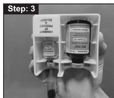
Step: 3 Aseptically remove 3 mL sterile diluent from the vial with the help of sterile syringe.