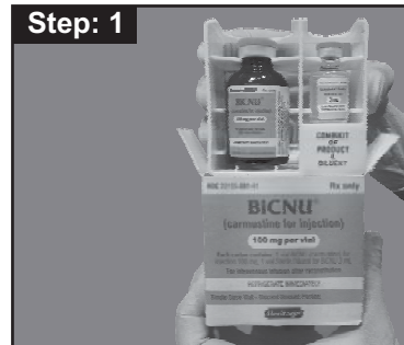
Step: 1 Take out COMBI KIT Guard from carton & place on the table