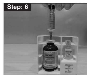
Step: 6 Aseptically add 27 mL Sterile Water for Injection USP.