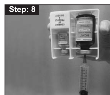
Step: 8 Aseptically remove the diluted product and infuse after further dilution as recommended with Sodium Chloride for Injection, USP or 5% Dextrose Injection, USP.

Please refer the product information leaflet before administration.