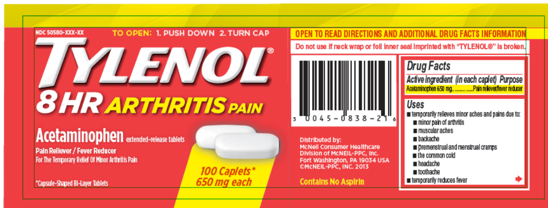
COVER, PAGE 1