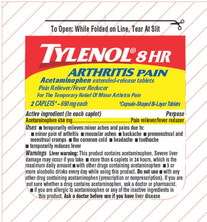
150% ACTUAL SIZE - FOR REVIEW ONLY