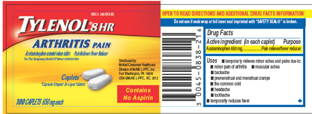
COVER, PAGE 1