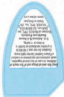
TOP PLY BACK (OPENED)