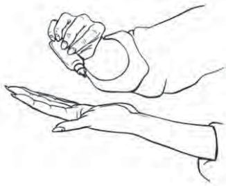
Figure 1. Dispense 10 drops of PENNSAID ® at a time

Step 2. Your total dose for each knee is 40 drops of PENNSAID ® . You will use 10 drops at a time. Put 10 drops of PENNSAID ® either on your hand or directly on your knee.