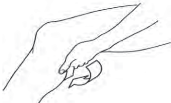
Figure 3. Spread PENNSAID ® evenly on the back of your knee

Step 4. Repeat steps 2 and 3 for the other knee if needed.