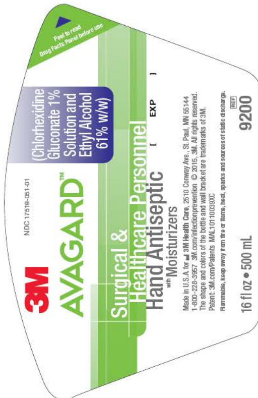
Front Cover Layer