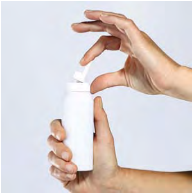
Figure A: Break tiny plastic piece on Olux-E Foam can nozzle.

2. Shake the Olux-E Foam can before use.