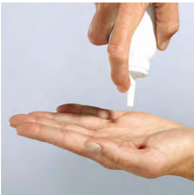
Figure C: Turn Olux-E Foam can upside down and press nozzle.

3. Turn the Olux-E Foam can upside down and press the nozzle. See Figure C.