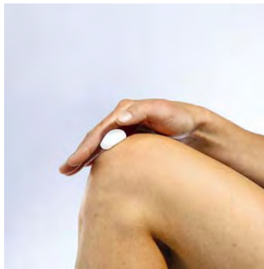
Figure E: Cover affected area with thin layer of Olux-E Foam. Rub foam gently into affected skin.

6. Avoid getting Olux-E Foam in or near your mouth, eyes, or vagina; if contact happens, rinse well with water. Wash your hands well after applying Olux-E Foam (excluding affected areas of hands).