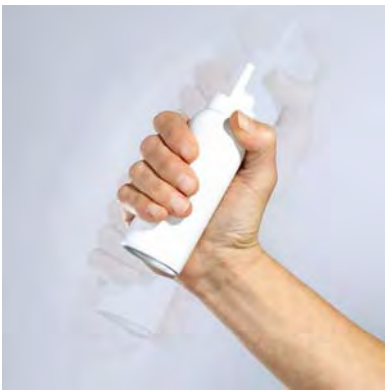
Figure B: Shake Olux-E Foam can.

2. Shake the Olux-E Foam can before use.