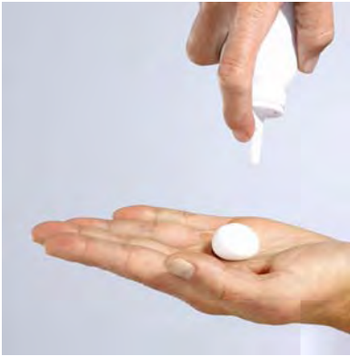
Figure D: Dispense Olux-E Foam into hand.

5. Use enough Olux-E Foam to cover the affected area with a thin layer. Gently rub the foam into affected area until it disappears into the skin.