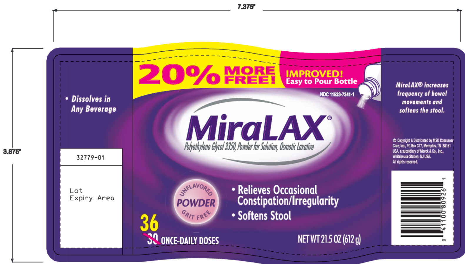
S-08-91r1 MiraLAX 30 Dose Fron Label