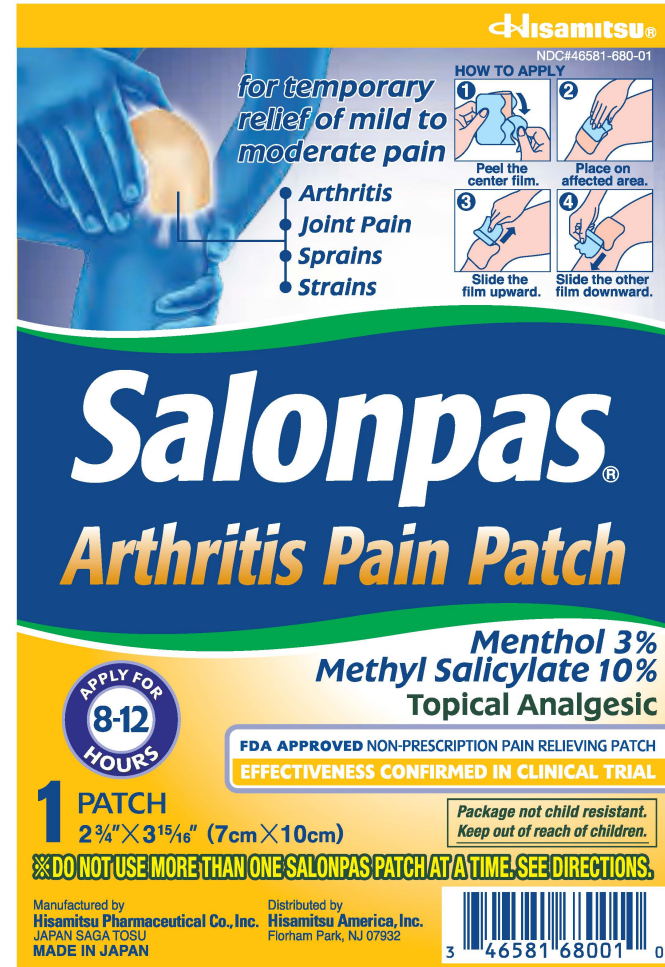
19.SARP original 1ct pouch commercial_210518