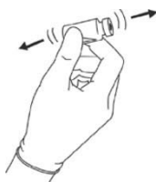
Figure 3: Vigorously shake vial.

Shake the vial vigorously until the suspension appears smooth and is consistent in color and texture. The suspended product will be yellow and opaque (see Figure 3).