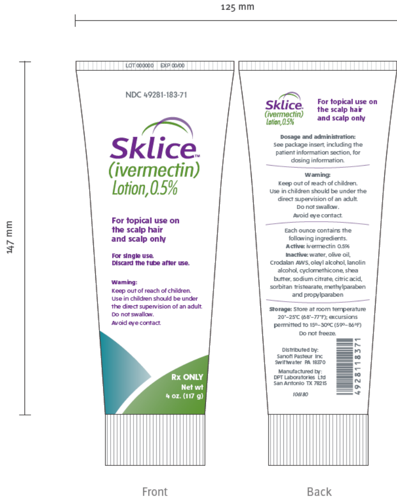
Sklice Tube Label