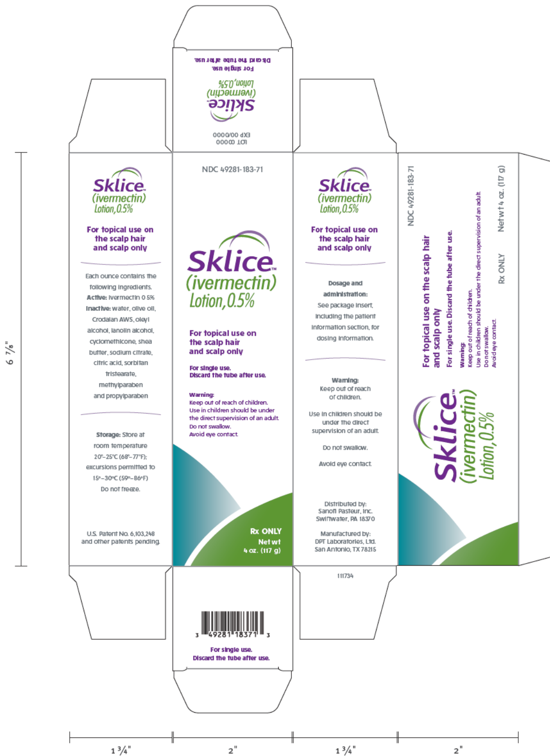
Sklice Tube Carton