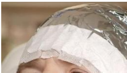
Figure 3: Occlusion

Cover the area where the gel has been applied with a light-blocking, occlusive dressing. Following 3 hours of occlusion, remove the dressing and wipe off any remaining gel.