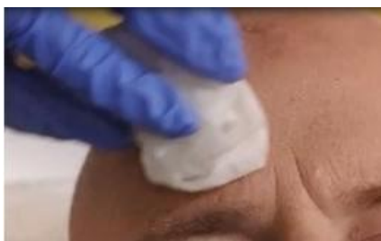
Figure 1A: Degreasing the skin

Before applying AMELUZ, carefully wipe all lesions with an ethanol or isopropanol-soaked cotton pad to ensure degreasing of the skin.