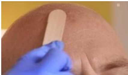
Figure 2: Drug application

Use glove protected fingertips or a spatula to apply AMELUZ. Apply gel approximately 1 mm thick and include approximately 5 mm of the surrounding skin. Use sufficient amount of gel to cover the single lesions or if multiple lesions, the entire area. Application area should not exceed 20 cm 2 and no more than 2 grams of AMELUZ (one tube) should be used at one time. The gel can be applied to healthy skin around the lesions. Avoid application near mucous membranes such as the eyes, nostrils, mouth, and ears (keep a distance of 1 cm from these areas). In case of accidental contact with these areas, thoroughly rinse with water. Allow the gel to dry for approximately 10 minutes before applying occlusive dressing.