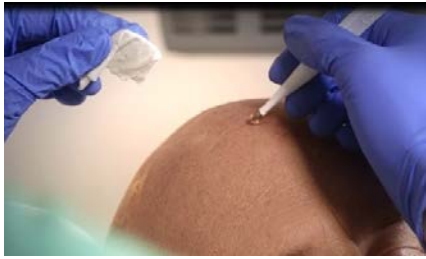
Figure 1B: Removal of scales and crust