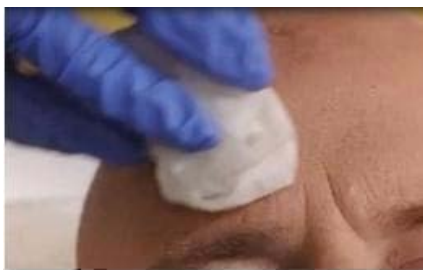
Figure 1A: Degreasing the skin

Before applying AMELUZ, carefully wipe all lesions with an ethanol or isopropanol-soaked cotton pad to ensure degreasing of the skin.