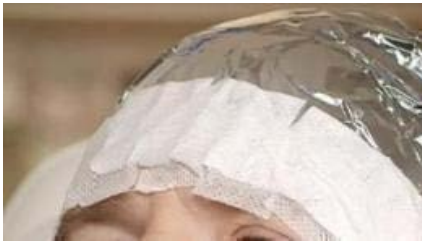
Figure 3: Occlusion

Cover the area where the gel has been applied with a light-blocking, occlusive dressing. Following 3 hours of occlusion, remove the dressing and wipe off any remaining gel.