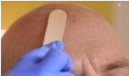
Figure 2: Drug application

Use glove protected fingertips or a spatula to apply AMELUZ. Apply gel approximately 1 mm thick and include approximately 5 mm of the surrounding skin. Use sufficient amount of gel to cover the single lesions or if multiple lesions, the entire area. Application area should not exceed 20 cm 2 and no more than 2 grams of AMELUZ (one tube) should be used at one time. The gel can be applied to healthy skin around the lesions. Avoid application near mucous membranes such as the eyes, nostrils, mouth, and ears (keep a distance of 1 cm from these areas). In case of accidental contact with these areas, thoroughly rinse with water. Allow the gel to dry for approximately 10 minutes before applying occlusive dressing.