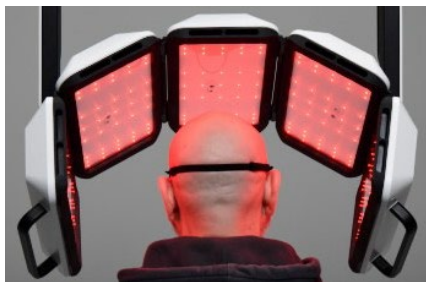
Figure 4B: Illumination with RhodoLED XL

If for any reason, the lesions cannot be illuminated within 3 hours after AMELUZ application, rinse off the gel with saline and water. For 2 days, protect the lesion sites and surrounding skin from sunlight or prolonged or intense light (e.g., tanning beds, sun lamps).