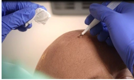
Figure 1B: Removal of scales and crust