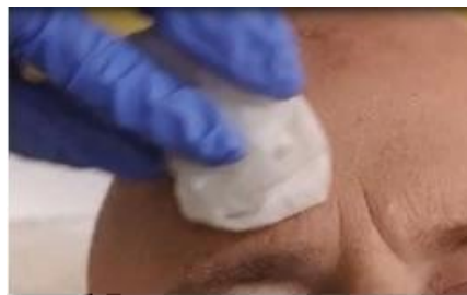
Figure 1A: Degreasing the skin

Before applying AMELUZ, carefully wipe all lesions with an ethanol or isopropanol-soaked cotton pad to ensure degreasing of the skin.