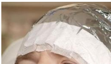
Figure 3: Occlusion

Cover the area where the gel has been applied with a light-blocking, occlusive dressing. Following 3 hours of occlusion, remove the dressing and wipe off any remaining gel.