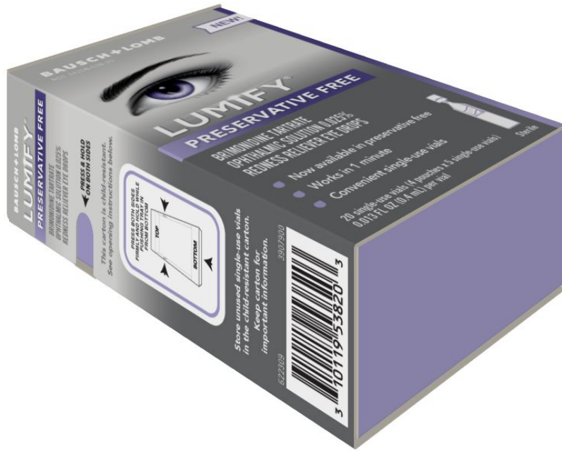
Closed Carton w/Sleeve and Tray